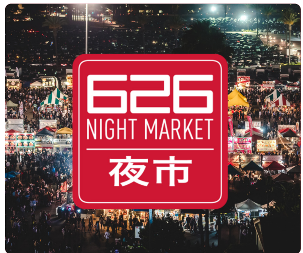
626 Night Market

night market —night markets are street markets that operate at night. The history of night markets goes back to the Tang dynasty in China (618 to 907 CE), and today night markets are a common part of social and community life in Asia and Asian diasporic communities. Taiwan has more than 700 night markets.