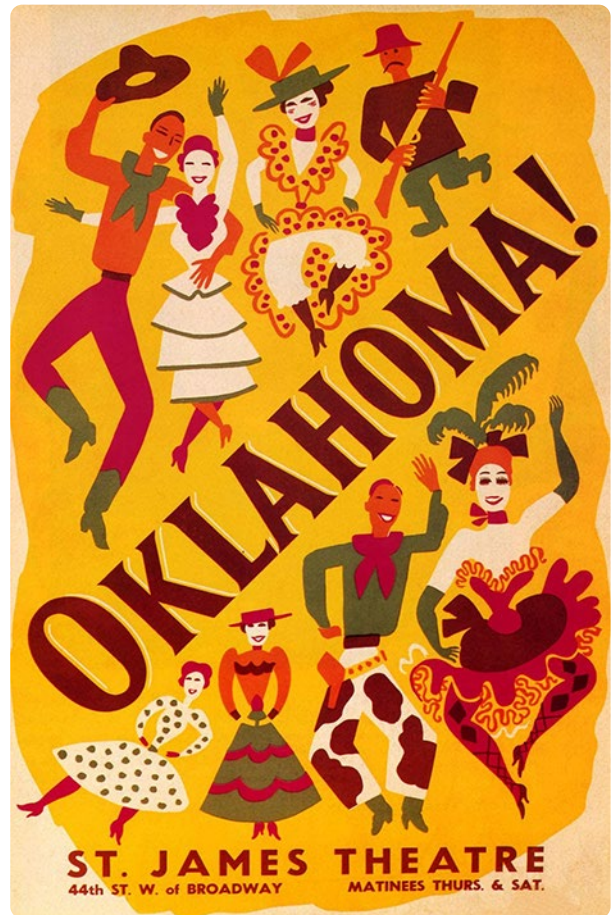
Original Broadway poster (1943)