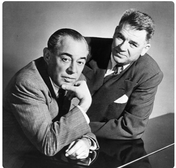
Richard Rodgers and Oscar Hammerstein II